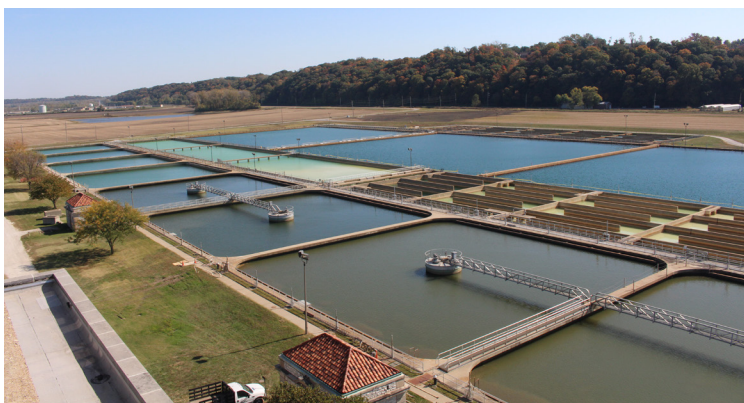
Howard Bend Plant

In 2024, our plants produced an average of 135 million gallons of high-quality, safe drinking water per day.