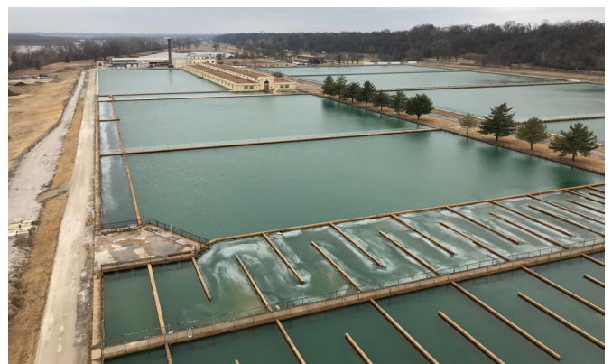
Chain of Rocks Plant